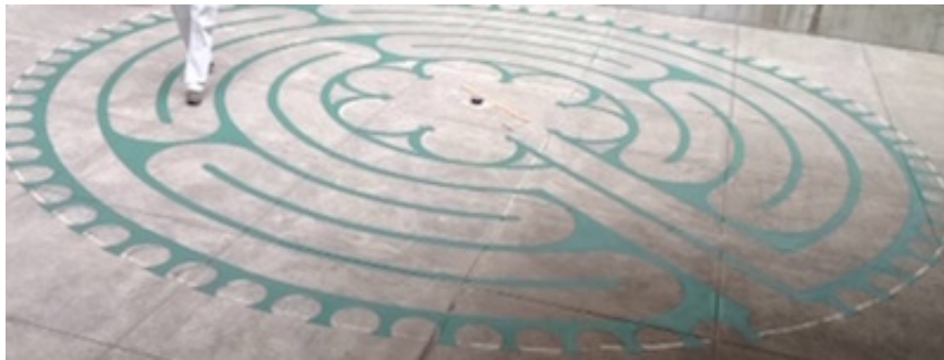
New labyrinth at St. James Lutheran 1315 SW Park Avenue, Portland, OR