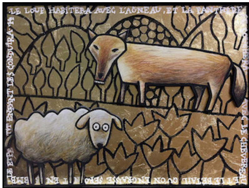
SACHA, Wolf and Lamb

The Bridge New Art Exhibit around the Labyrinth at Trinity Episcopal Cathedral in Portland July 10 - August 21, 2016