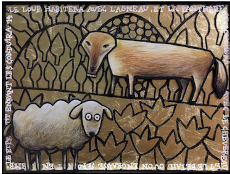
SACHA, Wolf and Lamb

The Bridge New Art Exhibit around the Labyrinth at Trinity Episcopal Cathedral in Portland July 10 - August 21, 2016