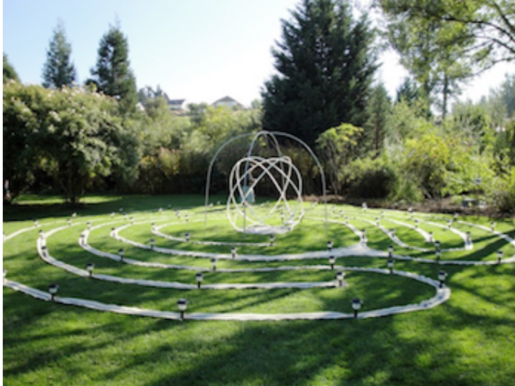
The Genesa Labyrinth