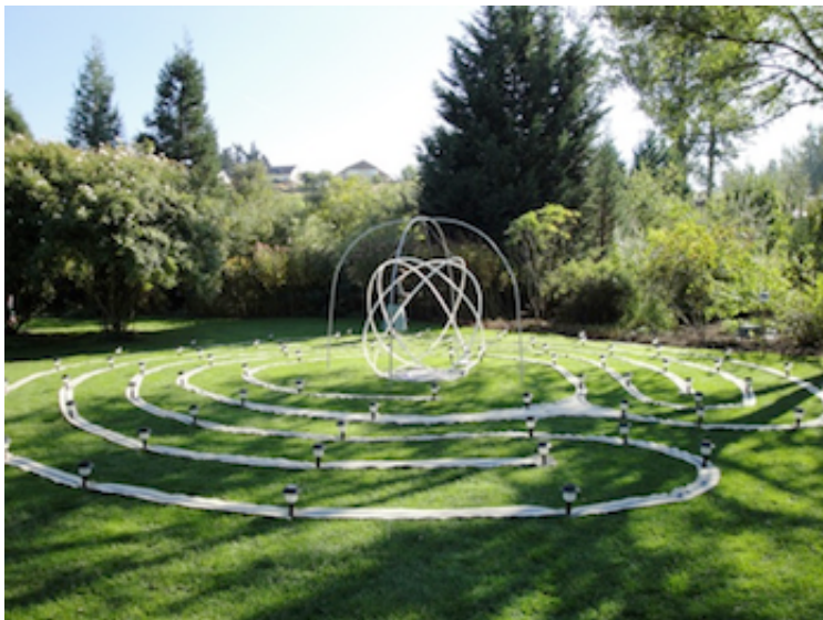
The Genesa Labyrinth