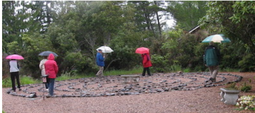
2009 The first World Labyrinth Day Florence, Oregon