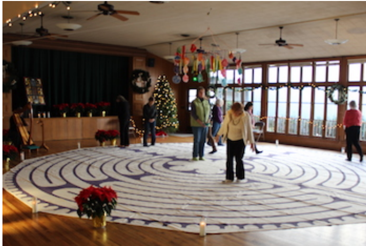
New Year's Peace Walk 2013 Grace Memorial Episcopal Church Portland, OR