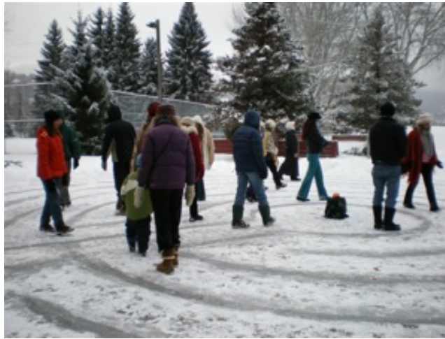
Lakeside Labyrinth, Nelson, B.C. Winter Solstice 2007

http://www.labyrinth.kics.bc.ca/LABYRINTH/HOME.html